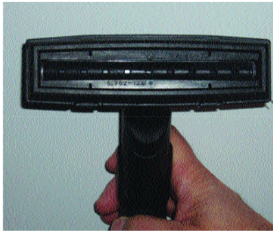
Tools with multiple steam ports provide even coverage.