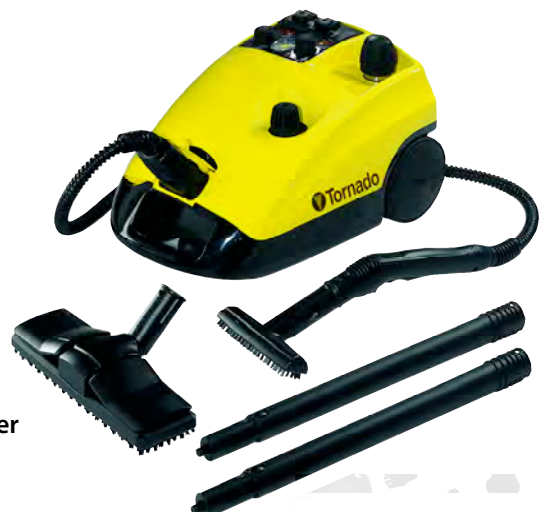
Tornado's DE 4002 Steam Cleaner

Use of a HEPA Vacuum and Tornado DE 4002 Steamer can dramatically lower the amount of pesticide needed.