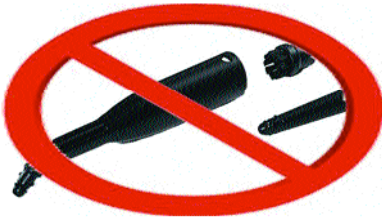
Single spray jets can fling bed bugs from the surface without killing them