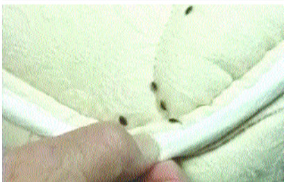
Signs of active infestations