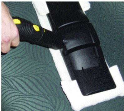
Direct contact and increased heat when used with a cloth wrap

treatment provides such an effective kill rate, the primary focus of the use of pesticide essentially changes from the primary means of attack, to that of providing residual kill benefit. Hence, use of a professional-grade, commercial steamer or other forms of heat treatment, is one of the most effective means of addressing a bed bug infestation in a “socially responsible” manner. It really does little good to rid a facility of bed bugs, if in doing so you create another set of problems with respect to toxicity of the area treated. That is why use of a commercial-grade steamer, followed by appropriate chemical treatment is a much more environmentally preferred means of addressing an infestation.