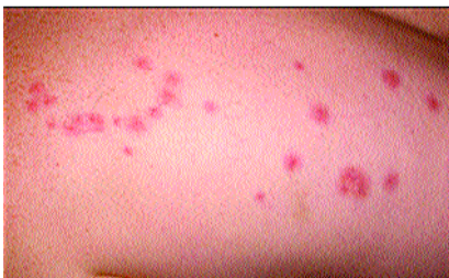
Bed bug bite

The problem we have today is that although there are now less-toxic pesticides available, they have proved to be far less effective in killing bedbugs. It is also quite difficult to get new pesticides approved by the federal government, particularly any pesticide that could come in direct contact with humans. Fortunately, there are options that are proving to be both effective and safer for the user and the environment. One is the use of professional steam cleaners.